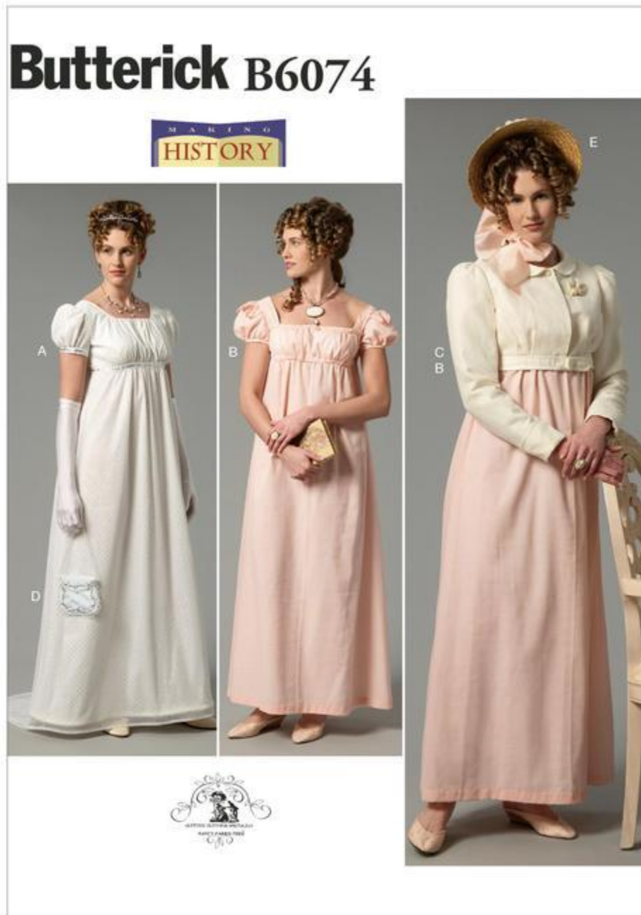
Butterick 6074: Regency dress with Spencer Jacket

Many people of the time were appalled by this dress—showing off a woman’s figure was unheard of until this style. They thought women were running around ‘practically naked.’