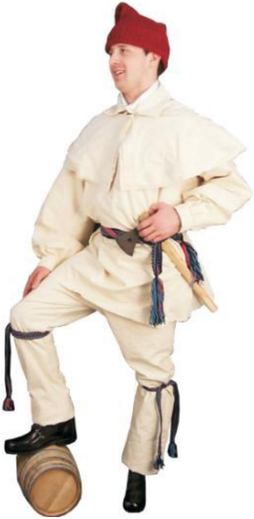
The 'hunter' look, with a knit Voyageur cap, or a felt hat blank, shown below: