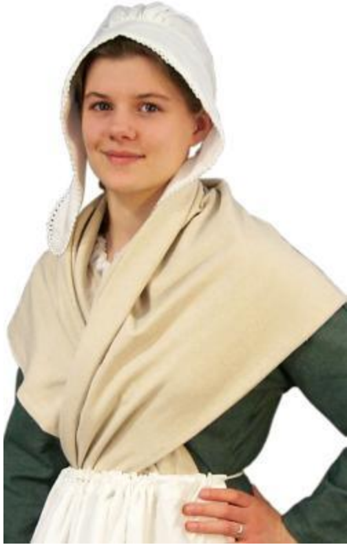
Neck Kerchief and apron from Townsends