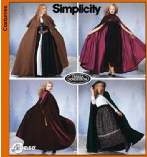
Simplicity 5794 Capes