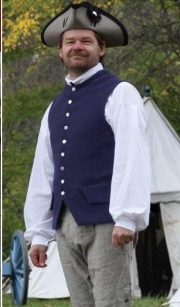
The more 'colonial' man look—some of our Dads wear an outfit like this one (above).