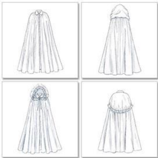
McCalls 4698 Kinsale Cape