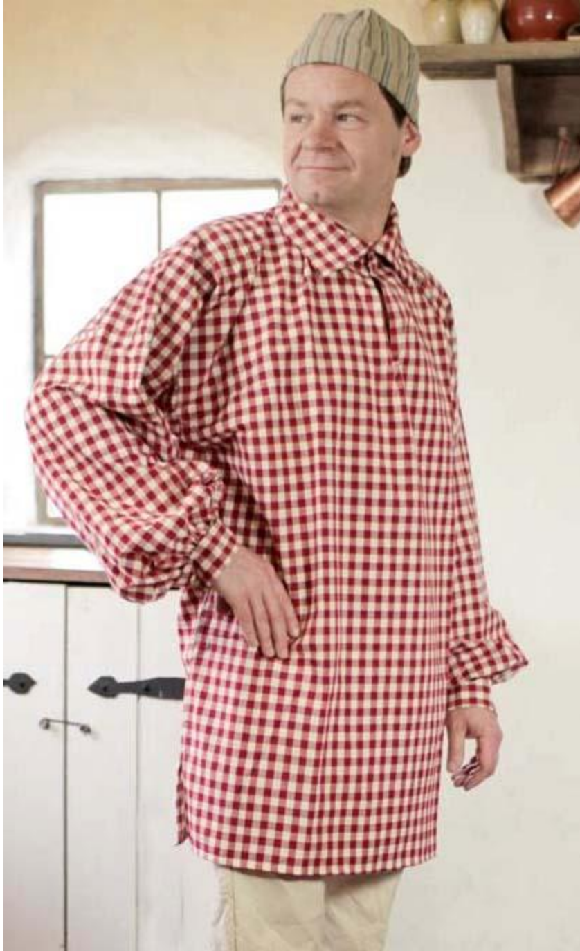
Some Dads wear a work shirt (above), with a felt hat blank.