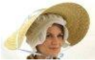
Some Moms wear a cotton mob cap with straw hat on top