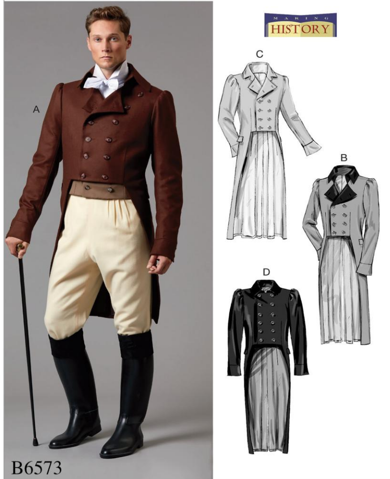
Butterick 6573 Mens Tailcoat

And the men would have typically dressed like this (above) if we wear the 'modern' Regency empire waist dress. But ours typically don't—most Dads dress like below. . .