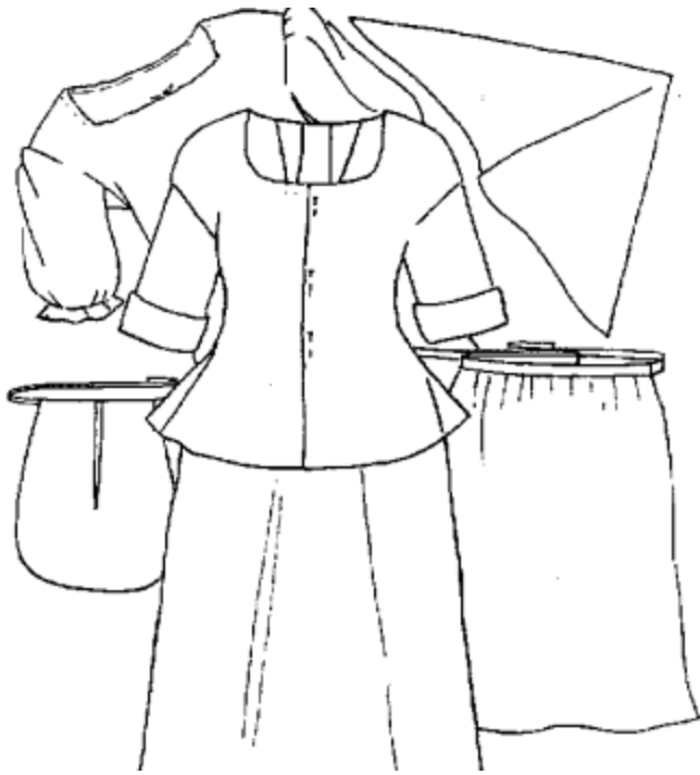
JR Ryan Womens Basic Six-Piece Wardrobe Pattern (JR-705)